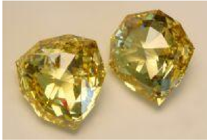
Florentine Pair: Left stone is modeled after a hatpin photo c. 1900 supposedly of the Florentine and described by Tillander. Right stone is modeled after a line drawing by Tavernier.

The Florentine is one of those elusive stones that is difficult to track down. Tillander (1995), p. 199, there are six line drawings of different versions of the stone as described by different sources. Tavernier has provided one of the earliest references to it in the 1600's. Cletscher drew it in the early 1700's from some unknown source, but it is a more rounded stone. Bauer around 1900 has his version. All three of these lived contemporaneously with the stone and may have viewed it first-hand (certainly Tavernier). Their facet patterns are similar, yet their outlines are different.